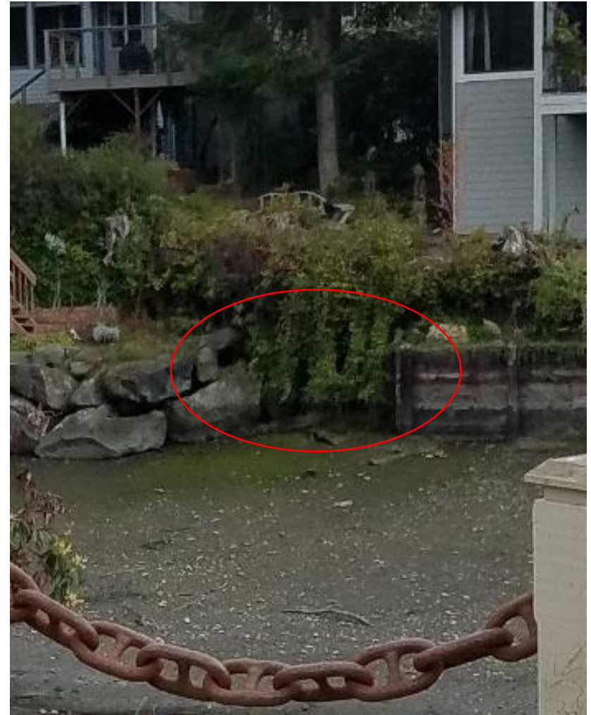
Current East End of Trail with forward thinking bridge landing initiated. Old easement seen in break in between bulkheads in the distance.