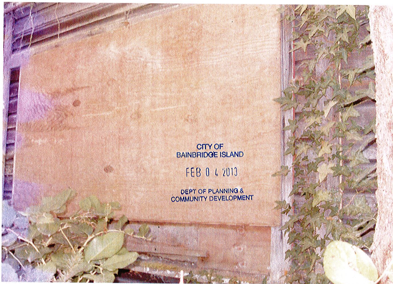
Samsung Techwin VLUU L100, M100 / Samsung L100, M100 Focal Length: 6.3mm (35mm equivalent: 35mm) 1/45s f/2.8 ISO: 240