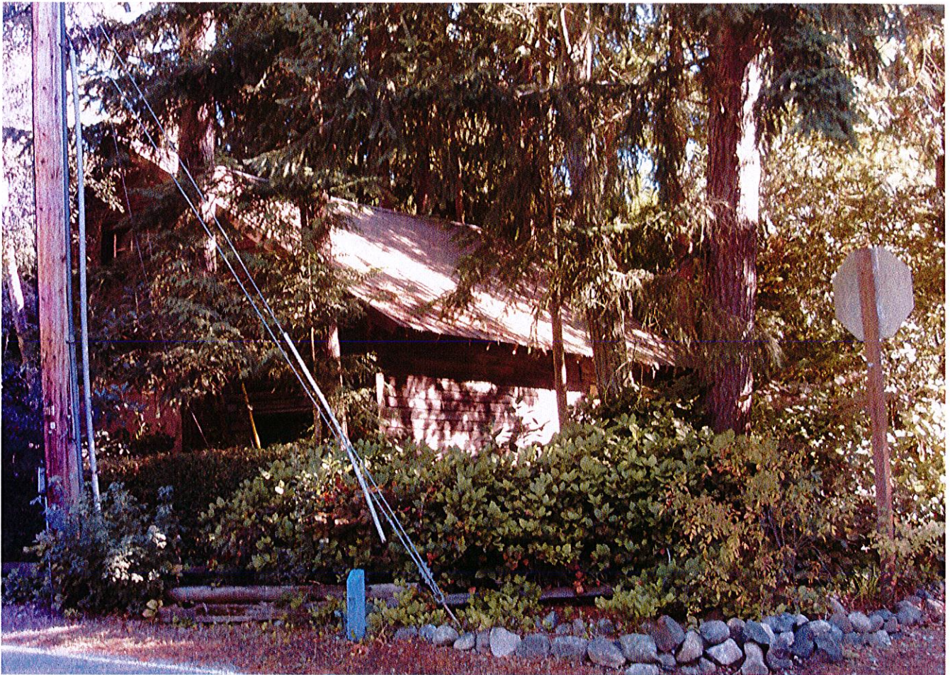
Samsung Techwin VLUU L100, M100 / Samsung L100, M100 Focal Length: 6.3mm (35mm equivalent: 35mm) 1/60s f/2.8 ISO: 100