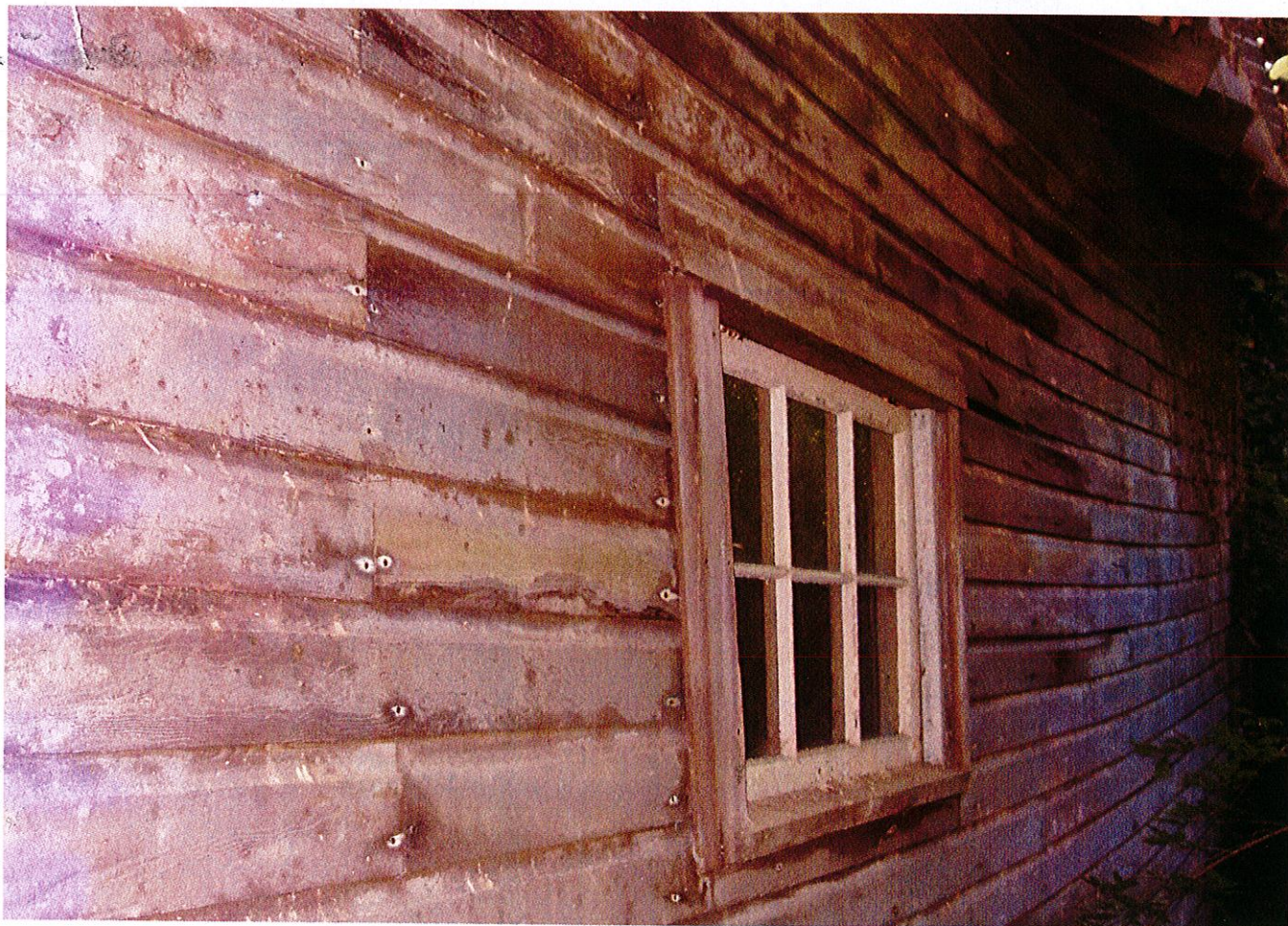
Samsung Techwin VLUU L100, M100 / Samsung L100, M100 Focal Length: 6.3mm (35mm equivalent: 35mm) 1/45s f/2.8 ISO: 160