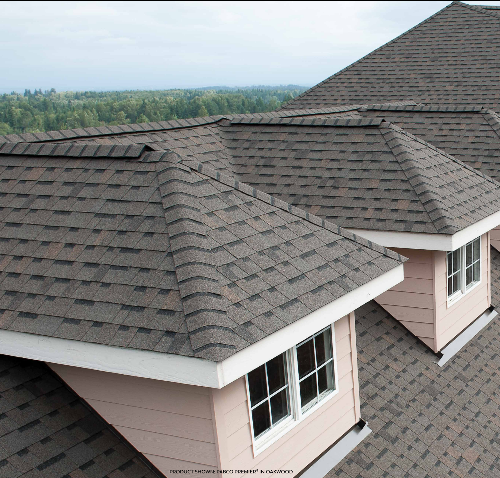
PRODUCT SHOWN: PABCO PREMIER® IN OAKWOOD

PABCO® Roofing Products Exceptional People. Remarkable Products.®